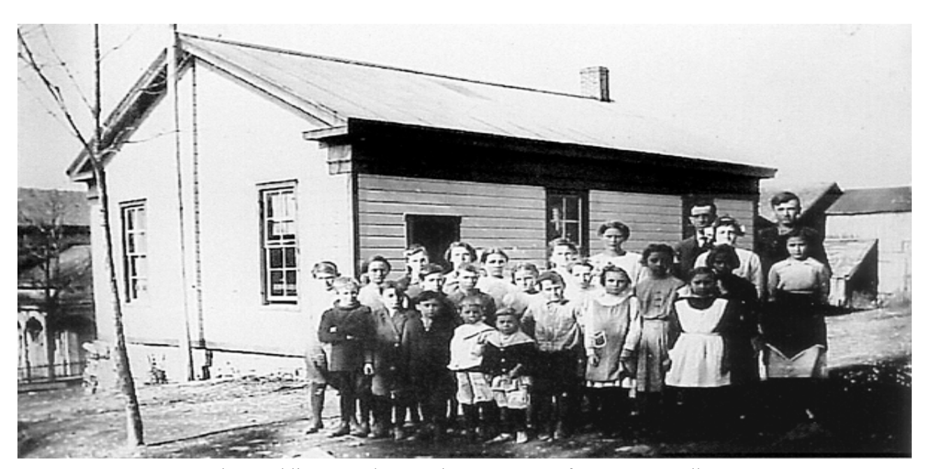
The Franklinton graduates.