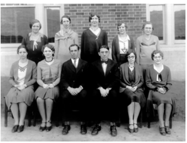
Teachers at the new Gilboa-Conesville Central School